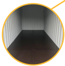
Hybrid Bamboo with PSF

ANY COLOR YOU DESIRE (in addition to the standard ones shown here)